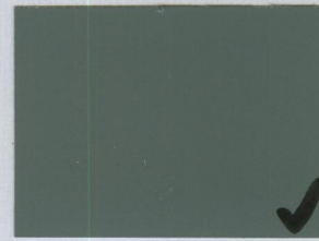
P12 Storm Gray