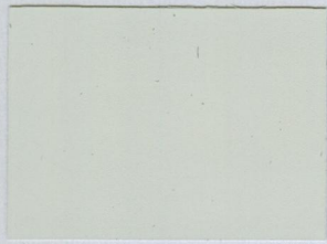
P34 Nantucket White