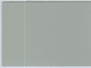
P31 Gray Linen