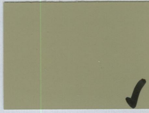
P22 Arena Buff