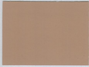
P21 Coral Gables Pink