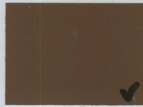
P15 Brick Red