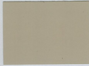
P24 French Cream