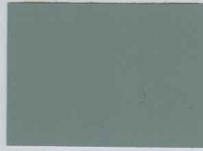
P26 Cape Cod Gray